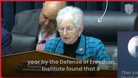
DFI's Leveling the Playing Field series earns a reach of 244k on Facebook and Instagram combined and 44k impressions on Twitter